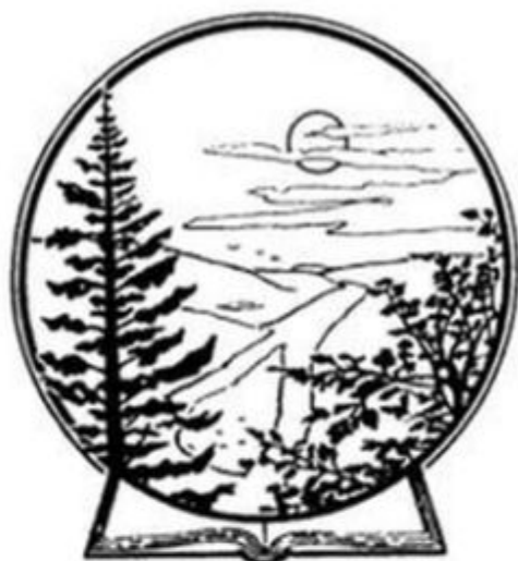
WATERMAN CONSERVATION EDUCATION CENTER APALACHIN, NY